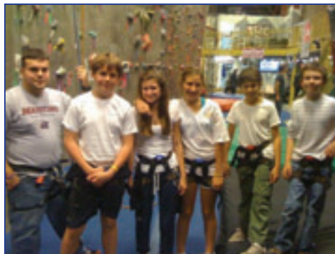
Middle-schoolers climbing at The Rock Club in New Rochelle.

In an effort to keep up the good work, there will be a regular class meeting on Sunday, December 6 in the Westminster Room. On December 13, the class will be meeting after church to do some creative and artistic preparation for the Christmas Eve family service. Best to wear clothes you don't mind getting messy! Reflection papers on a passage from the gospel of Luke are due that day!