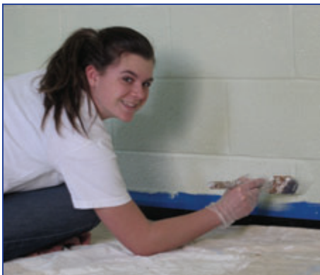
Mission Team practicing painting skills on the West- minster Room.