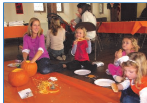
Carving pumpkins at the Fall Family Fellowship event.

The Rock Club in New Rochelle survived our presence last month as the group took to their many climbing walls. In addition to a special trip to see Joseph in Bridgeport, CT at The Downtown Cabaret Theatre, this month we'll meet twice at the church – December 1 and 15. In our own unique "Connection" way welcome the Christmas season! All sixth to eighth graders are welcome.