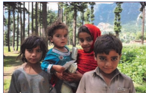
Children of Pakistan

www.savethechildren.org . Thank you for your support.