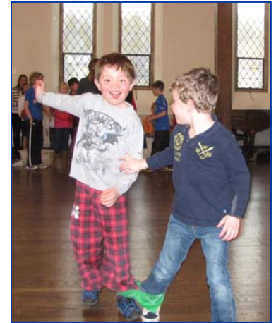
Having fun competing in the three-legged race! ↑