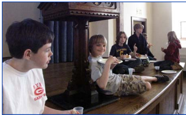
← Enjoying ice cream and refreshments in the Assembly Room