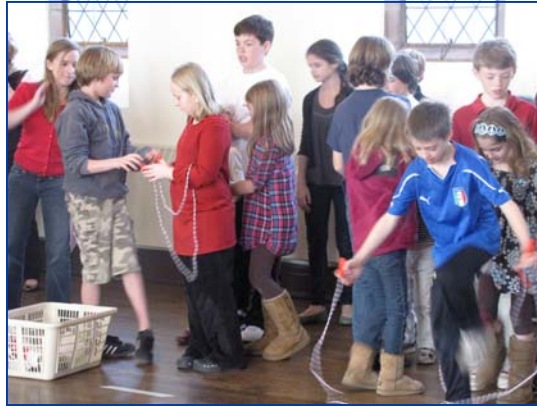
↑ Attendees jumped rope as part of a relay race