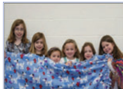
Blankets for Haiti

The program is open and free to all. For more information, to attend one of the sessions, or to volunteer to serve as a resource, please RSVP by email: livesintransition@gmail.com .